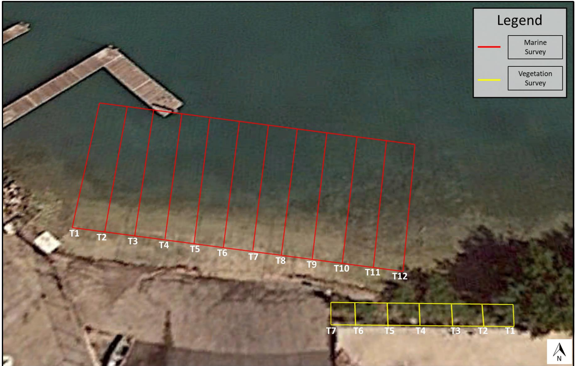
Figure 1. Map of Marine and Vegetation Survey Areas