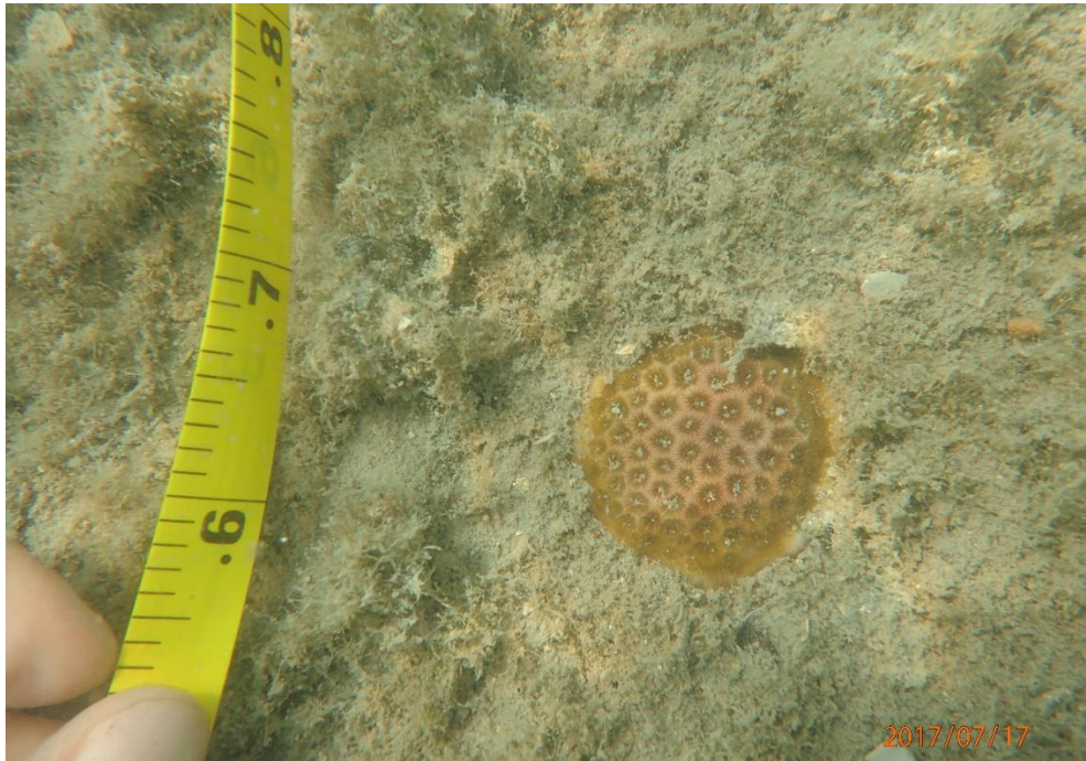
Photo 5. Siderastrea siderea coral observed on the existing concrete boat ramp.