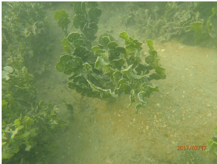
Photo 2. Halimeda sp. with sand, muck, crushed rock and shell. Typical conditions throughout the survey area.