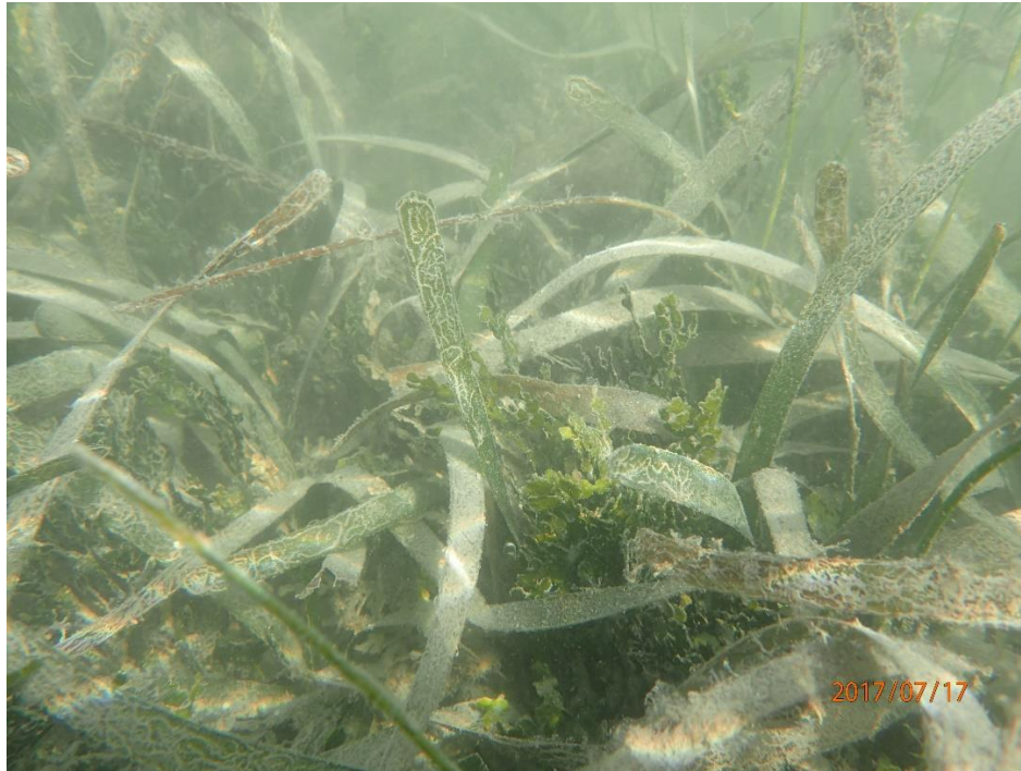
Photo 3. Syringodium filiforme , Thalassia testudinum and Halimeda sp.