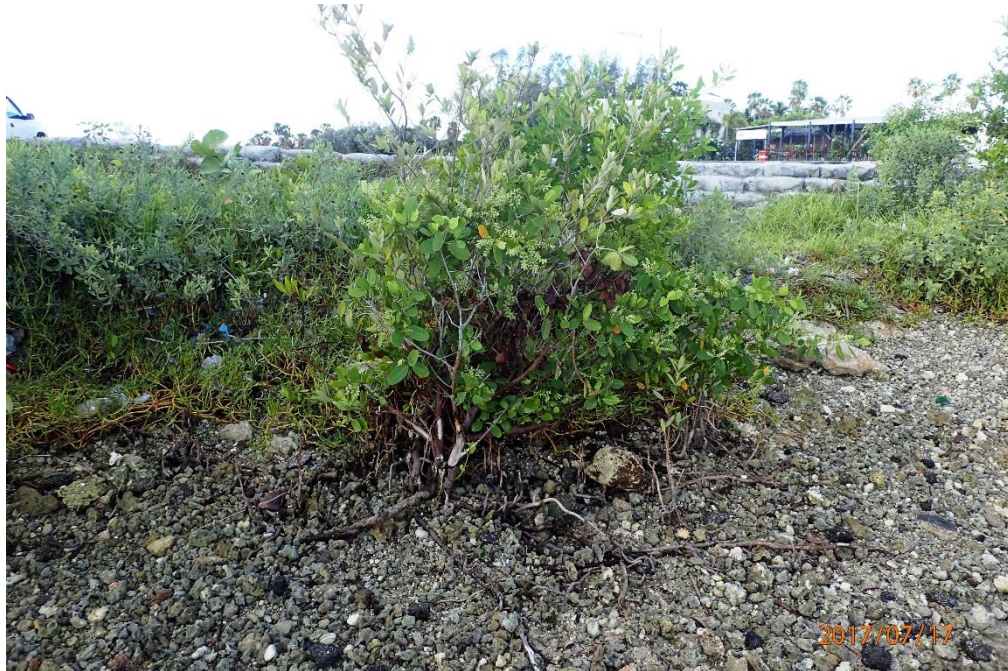
Photo 7. Laguncularia racemosa , Conocarpus erectus and Avicennia germinans .