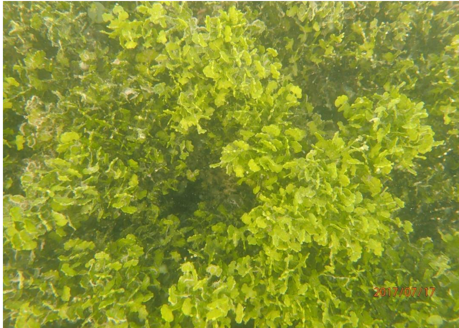
Photo 1. Dense Halimeda sp. macroalgae commonly found throughout the marine survey area.