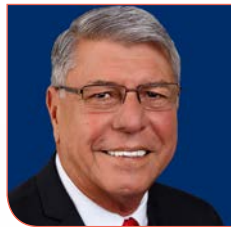
MANOLO REYES Commissioner