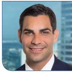
FRANCIS X. SUAREZ Mayor