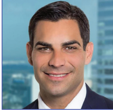
FRANCIS X. SUAREZ Mayor