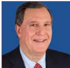
JOE CAROLLO Commissioner