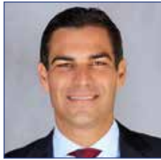
FRANCIS X. SUAREZ Mayor