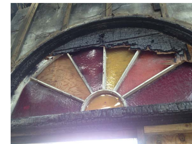
EXISTING CONDITION OF TRANSOM OVER MAIN ENTRY. TRANSOM TO BE REFURBISHED/RESTORED TO HISTORIC CONDITION AND REINSTALLED.