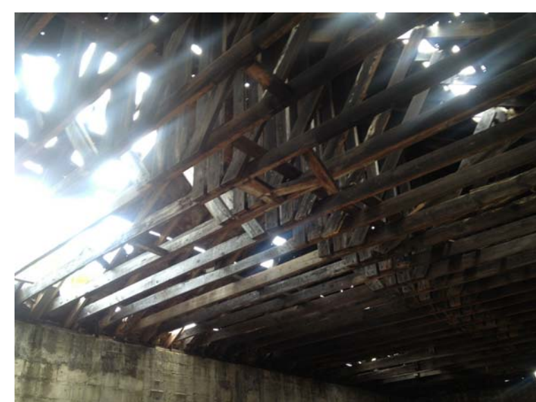
EXISTING WOOD TRUSSES TO BE SALVAGED. REMILLED AND REPURPOSED IN RESTORATION