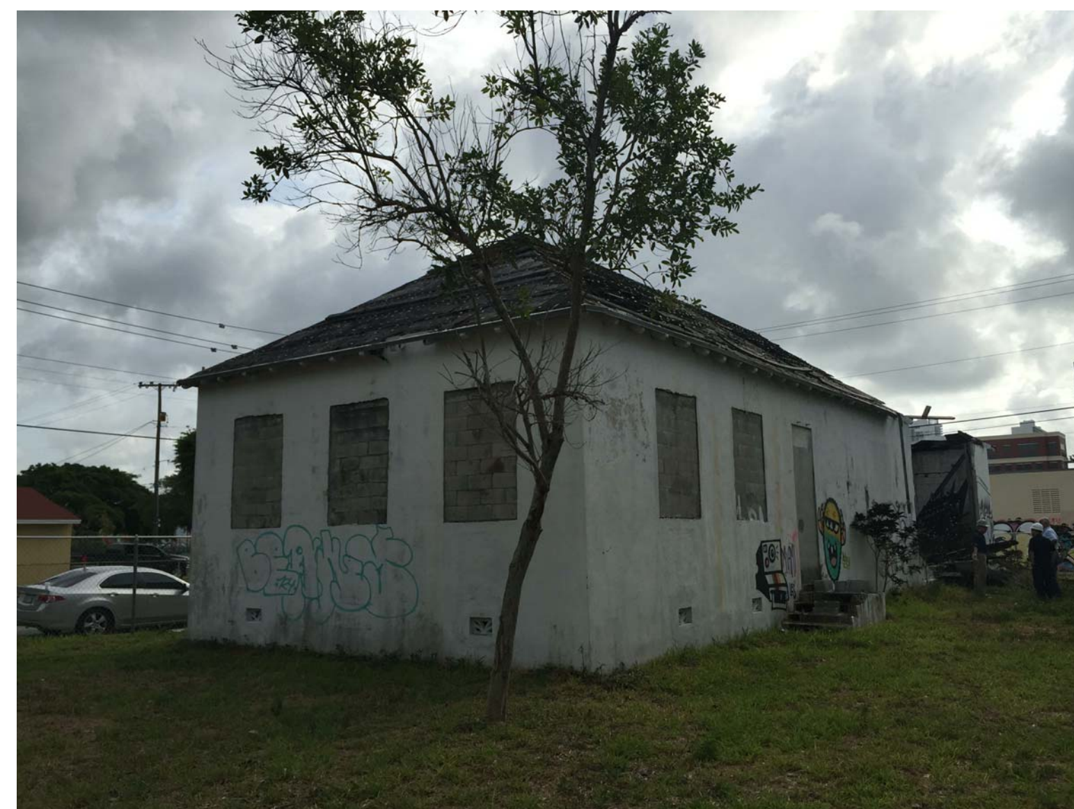
EXISTING CONDITION OF SOUTH WEST CORNER

REFER TO SHEET G2.1 FOR PHOTOS OF EXISTING AFTER SELECTIVE DEMOLITION AND SHORING OF EXTERIOR WALLS