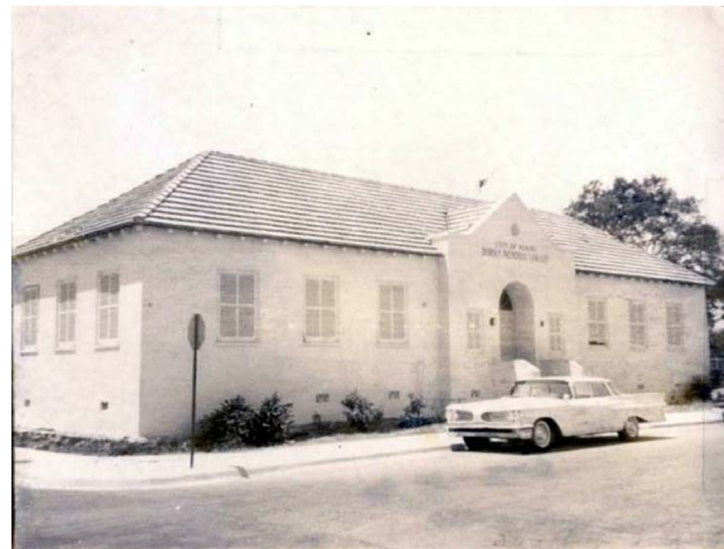
DORSEY MEMORIAL LIBRARY DURING THE 1960'S

REFER TO SHEET G2.1 FOR PHOTOS OF EXISTING AFTER SELECTIVE DEMOLITION AND SHORING OF EXTERIOR WALLS