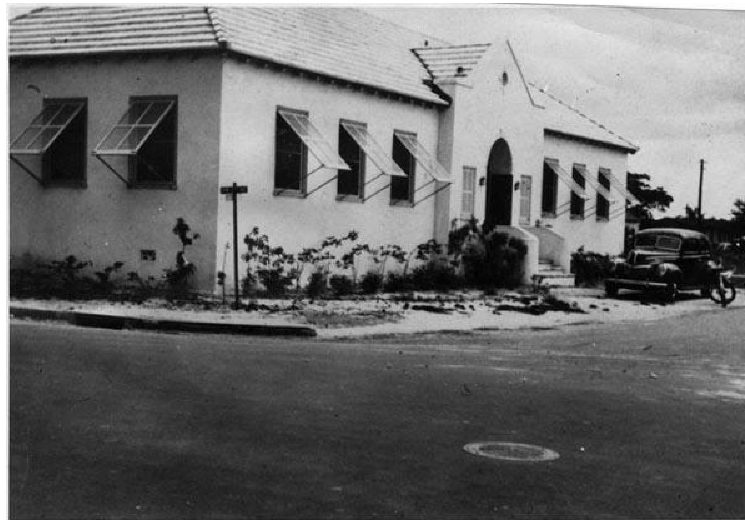
DORSEY MEMORIAL LIBRARY DURING THE 1940'S