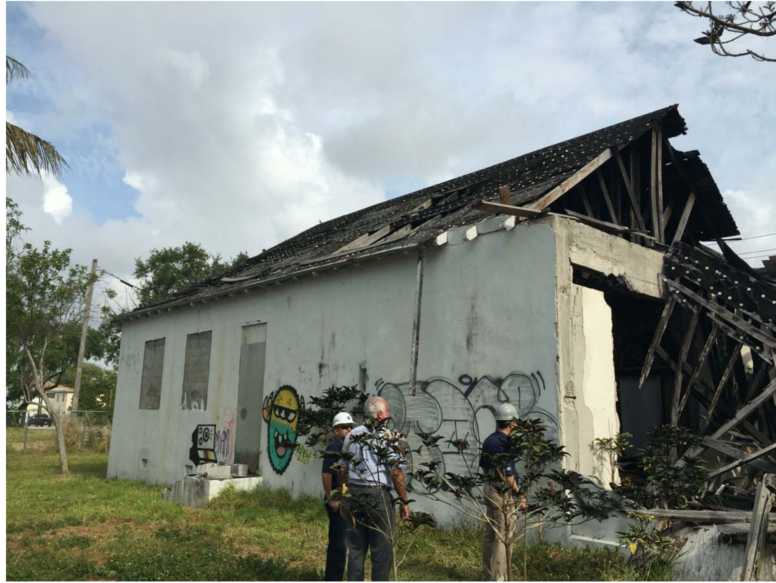
EXISTING CONDITION OF COLLAPSED OF ROOF