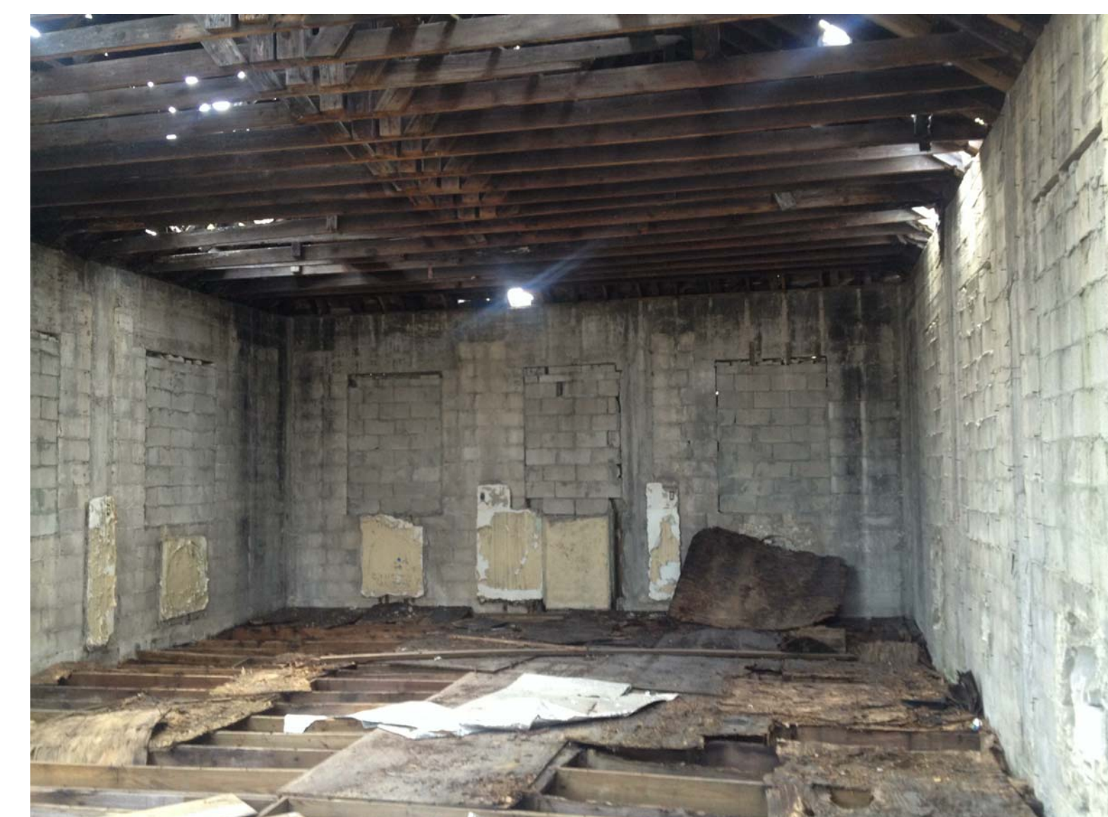
EXISTING INTERIOR CONDITION. WOOD FRAMING TO BE SALVAGED, REMILLED AND REPURPOSED IN RESTORATION