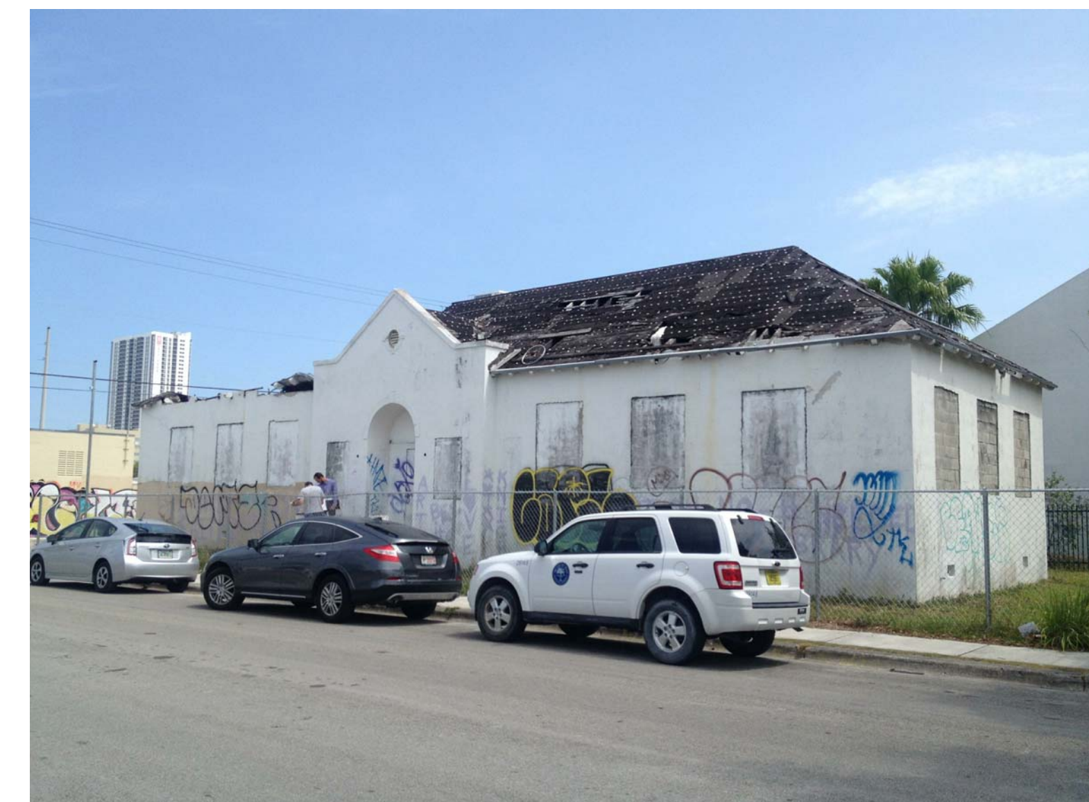
EXISTING CONDITION OF NORTH WEST CORNER (PRIOR TO ROOF REMOVAL)