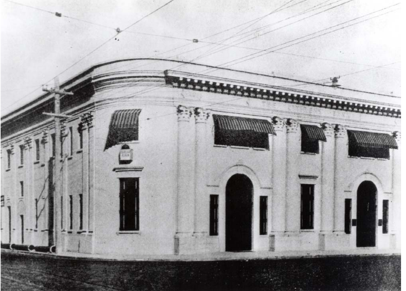
Citizens Bank 1367 N. Miami Avenue