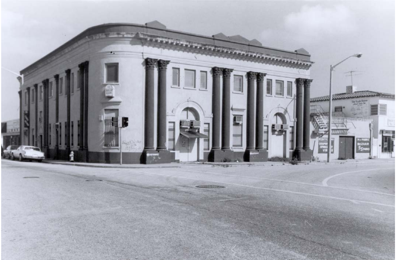
Citizens Bank 1367 N. Miami Avenue