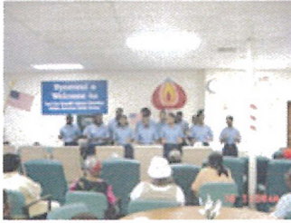
Fire/Safety Presentation at the Haitian American Senior Center

The Miami Rescue Explorers Post 780 has had many accomplishments over the years with very little funding as indicated below: